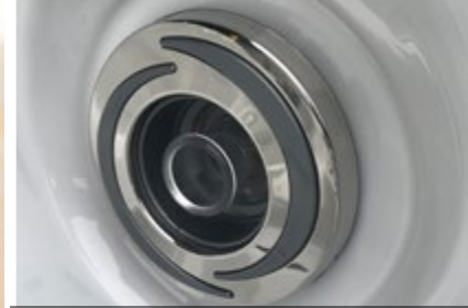
STAINLESS STEEL JETS