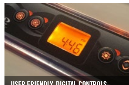
USER FRIENDLY, DIGITAL CONTROLS