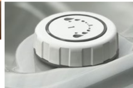
AIR & WATER DIVERTERS