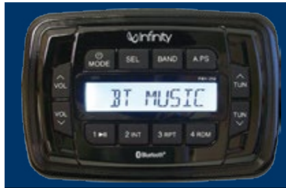
INFINITY™ AUDIO SYSTEM