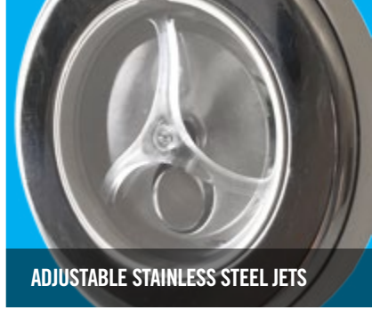
ADJUSTABLE STAINLESS STEEL JETS