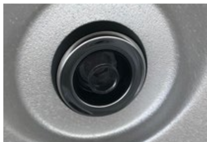
OPTIONAL JET COLOR PACKAGE