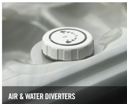
AIR & WATER DIVERTERS