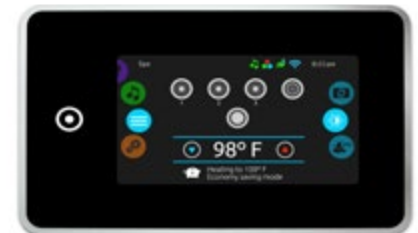
USER FRIENDLY, DIGITAL CONTROLS