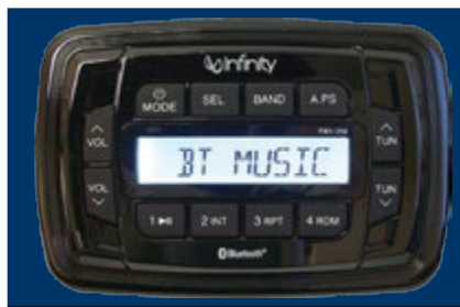
INFINITY™ AUDIO SYSTEM