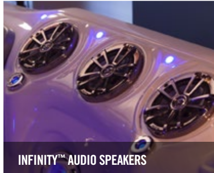
INFINITY™ AUDIO SPEAKERS