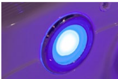
UNDERWATER LED LIGHTING