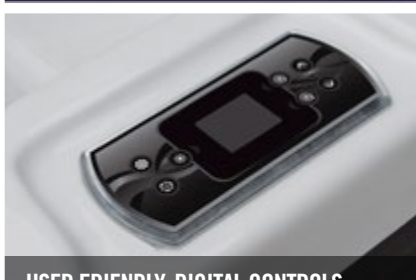
USER FRIENDLY, DIGITAL CONTROLS