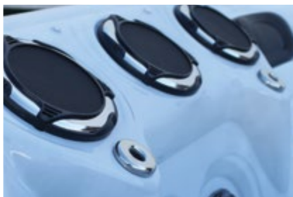
BLUETOOTH™ AUDIO SYSTEM