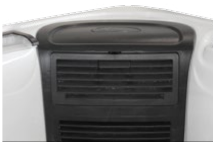
100SQFT FILTRATION SYSTEM