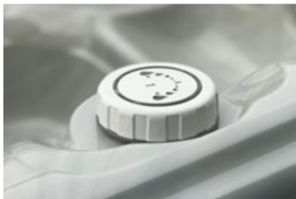
AIR & WATER DIVERTERS