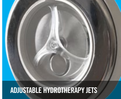
ADJUSTABLE HYDROTHERAPY JETS