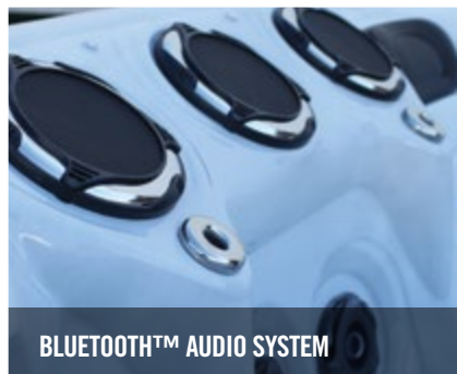
BLUETOOTH™ AUDIO SYSTEM