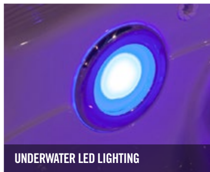
UNDERWATER LED LIGHTING