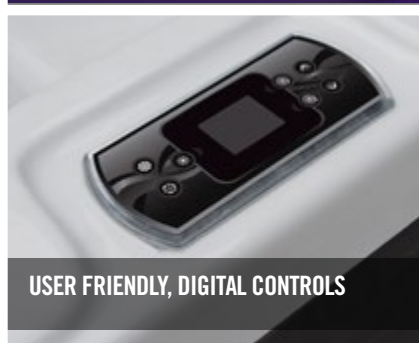
USER FRIENDLY, DIGITAL CONTROLS