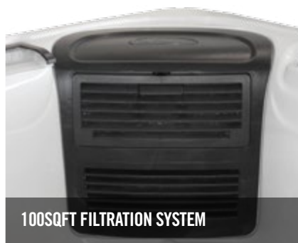
100SQFT FILTRATION SYSTEM