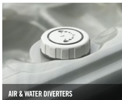
AIR & WATER DIVERTERS