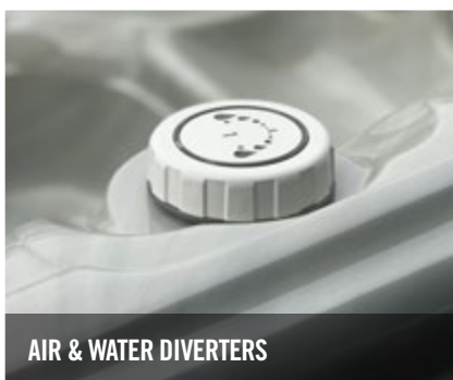
AIR & WATER DIVERTERS