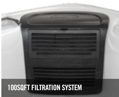
100SQFT FILTRATION SYSTEM