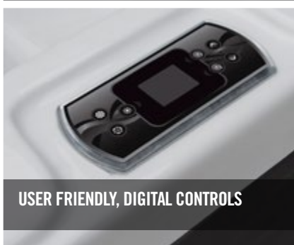
USER FRIENDLY, DIGITAL CONTROLS